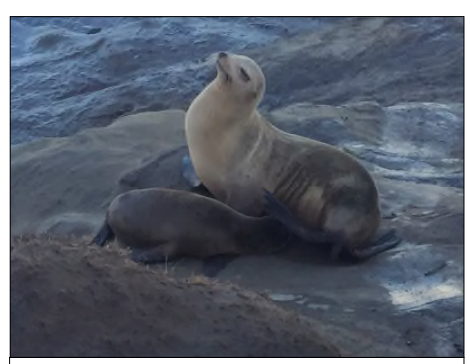
Sea lions cluster at arms length away at La Jolla cove

La Jolla Cove is a nature sanctuary where some days the lobsters come out and laugh at you because they know you can't touch them. Nearby is La Jolla Shores, a long open beach where, in the early winter, squid mate and die off. The feast draws large fish, dolphins and sea lions. A highlight of the event is to snorkel in five-foot deep waters surrounded by gorgeous leopard sharks, who could care less about people. They are non-aggressive and are just here for the easy squid. I once counted a dozen in view of my mask as I trolled the blue waters in my wetsuit. It's an easy swim and exciting, even when you know they are not going to bite.