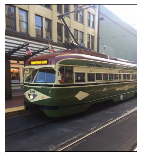
Vintage trolleys travel the downtown loop

Transportation in San Diego is interesting and diverse. The have trolley cars that you can pay for on your phone as well as buses and Free Ride. Free Ride is a fascinating concept. It is actually a free ride.