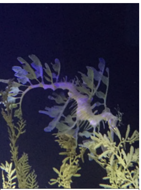
Leafy sea dragons are a major attraction at the Birch Aquarium in La Jolla

for the diving. There is a Star Wars episode with a chase scene where the characters ride riotously through the forest on rocket sleds. Imagine